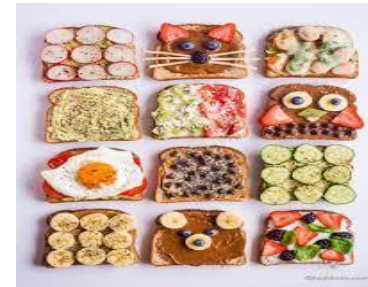
Literacy Skillbook Pg: 13,14

Development activities (35 minutes): Students will practice all the phonic sounds orally. Teacher will introduce /h/ with its